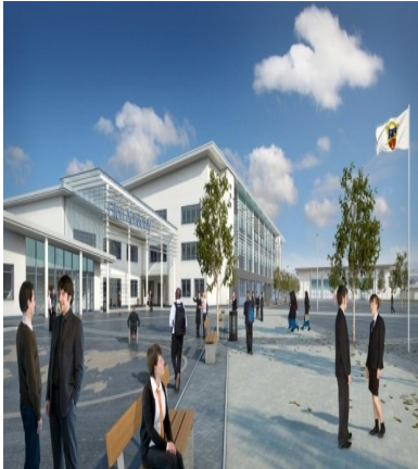
Ellon Academy Community Campus),