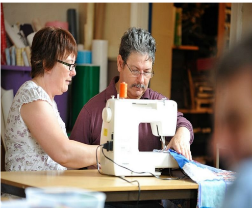
Lowestoft Community Hub

Rotterdam Road, Lowestoft, Suffolk, NR32 2EZ