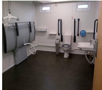
Great Notley Country Park

Northgate Car Park Chichester Chichester West Sussex PO19 1BL