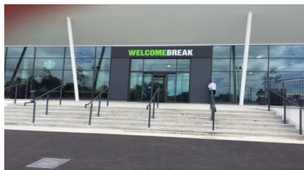
Sarn Park Welcome Break Motorway Services