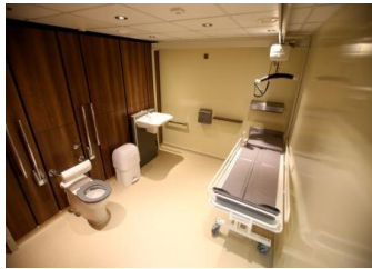
Southampton Football Club

St. Mary's Stadium Britannia Road Southampton SO14 5FP