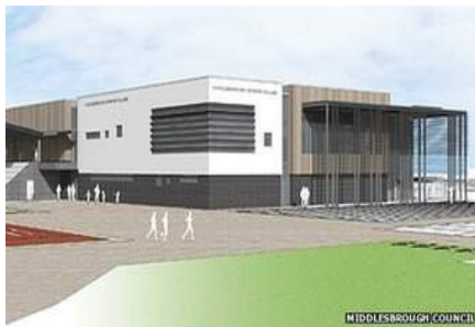
Middlesbrough Sports Village

4 Thames Street, Staines upon Thames, TW18 4SD