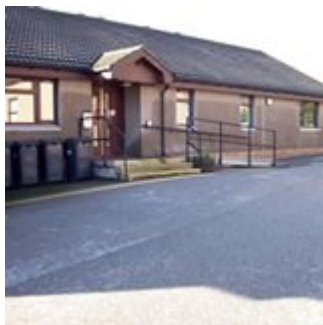
Ellon Resource Centre

Southchurch Avenue and Eastern Esplanade, SS1 2ER