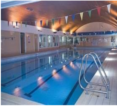
Kendal Leisure Centre,