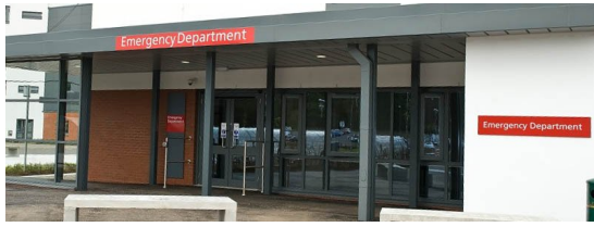
Forth Valley Royal Hospital,,