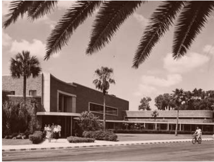
Hub Staines (The),

4 Thames Street, Staines upon Thames, TW18 4SD