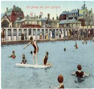
Marine Parade, Seafront

Southchurch Avenue and Eastern Esplanade, SS1 2ER